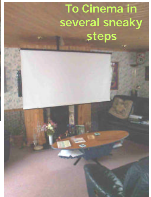
To Cinema in several sneaky steps