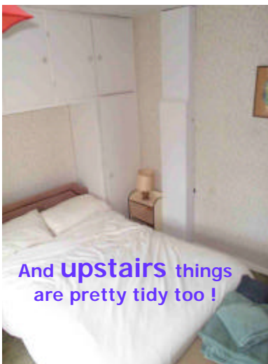
And upstairs things are pretty tidy too !