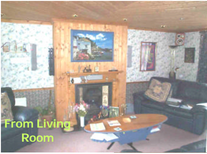
From Living Room